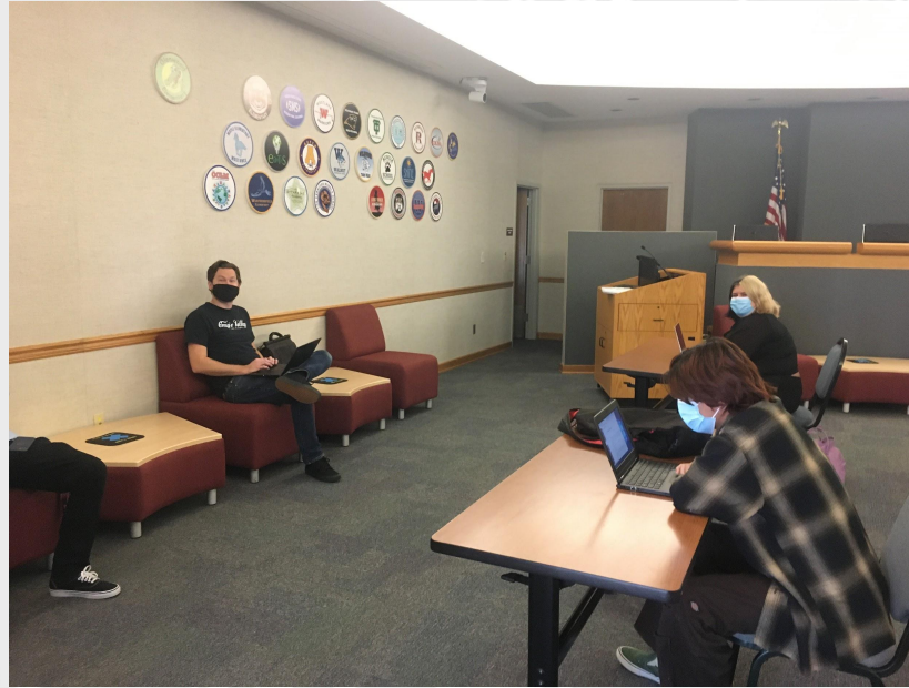
WHS A.P. Psych